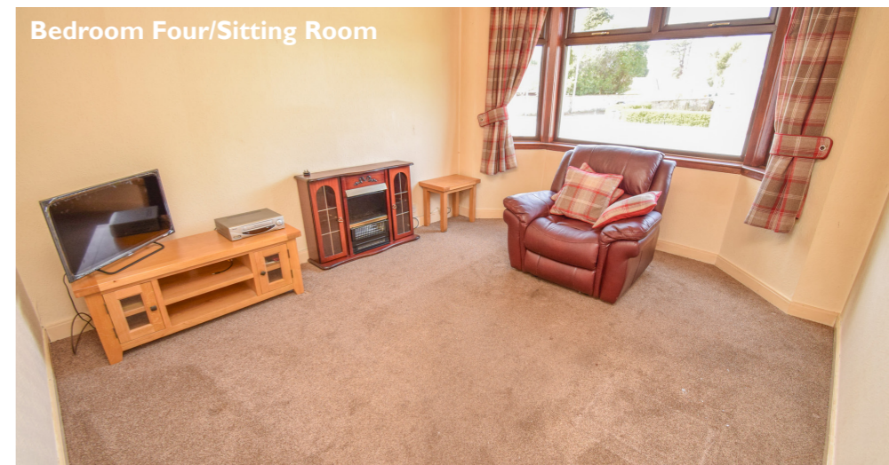
Bedroom Four/Sitting Room